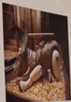
Das ist ein Pferd in München