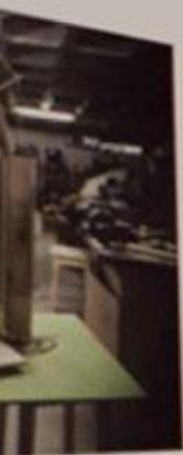
Das ist ein Tisch in München